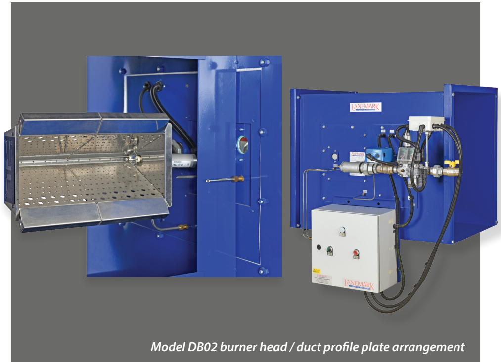
Model DB02 burner head / duct profile plate arrangement

Lanemark's DbCalc ® software is available to determine burner ratings and to design suitable duct profile plate arrangements at firing rates of up to 205 kW per 305 mm burner length.